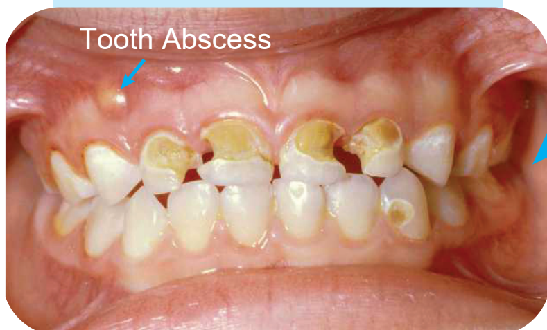
Can look like brown spots on the teeth. If left untreated, decay can quickly become severe, causing pain and infection.

Lift your child's top lip at least once a month and check for early signs of tooth decay.